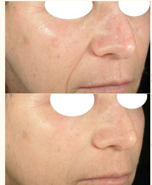
Patient treated with Photo Genesis, Laser Genesis and Titan